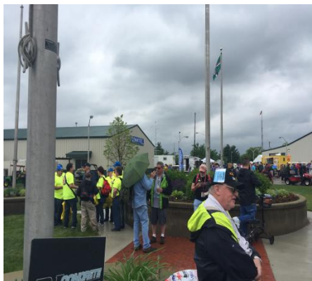
Figure 1 Dayton, yes bring your umbrella

The Dayton Hamvention® comes calling again after a hiatus of 2 years due to COVID-19, . This year celebrates the 70th year reunion (1952-2022) of the event when the first Dayton