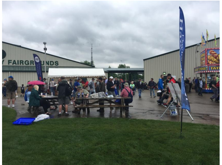
Figure 2 A lot of good eats available