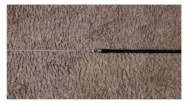
Hamstick with original stinger

Using the telescopic stringers allows the use of the 80M, 40M, 20M and 10M band to tune the lowest VSWR in the frequency range where you want to operate. If you need a different frequency range, you just change the length of the stinger. After finding the right length for the center frequency you want, record the length of the telescopic stinger for the next time you want to use that frequency for the lowest VSWR. Using the telescopic stingers make the Hamstick more versatile.