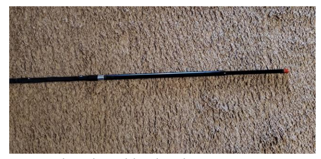
Hamstick with Buddipole telescopic