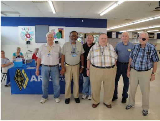
Figure 4 Louisa Club Members