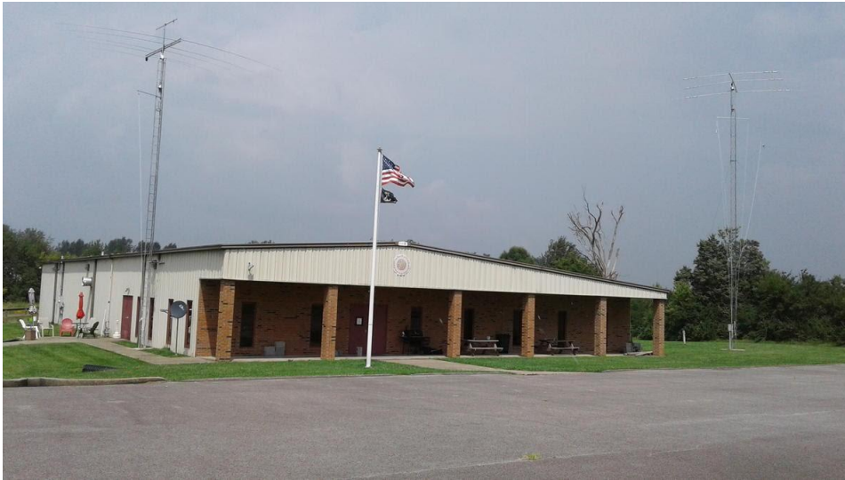
American Legion, meeting location for the Wilderness Trail ARC

The Kentucky D-Star net is held each Thursday at 7:00 PM on Reflector 56B. WRARC hosts a weekly 2M net each Wednesday at 8:00pm local time on the Danville Repeater (145.310 with -offset and PL Code 100) and also hosts the American Legion Amateur Radio Club monthly D-Star net on the First Monday of each month at 8:00 EST on Reflector 56C. The Wilderness Road Amateur Radio Club meets on the 4th Tuesday 7:30 PM of each month at American Legion Post 46, 45 Spears Ln, Danville, KY 40422. For more club information, please visit our website at www.wrarc.com .