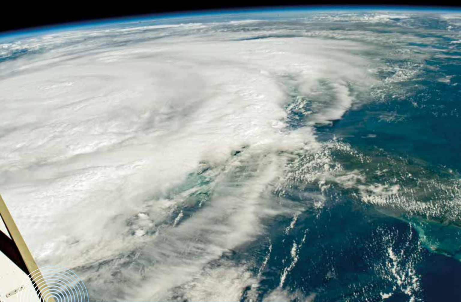
An External High-Definition Camera (EHDC) on the International Space Station captured this image of Hurricane Idalia at 11:35 a.m. Eastern Time (15:35 Universal Time) on August 29, 2023. Idalia was a category 1 storm over the Gulf of Mexico with sustained winds of 140 kilometers (85 miles) per hour, according to the National Hurricane Center. Part of Cuba is visible on the right side of the image.