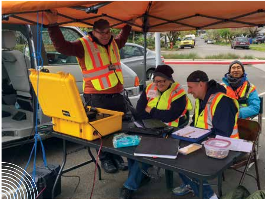
Multnomah County, Oregon ARES members at a field station for the Statewide Fall Simulated Emergency Test (SET).