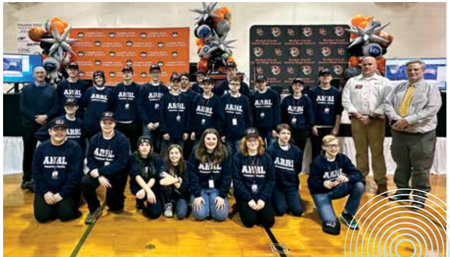
Students from Harbor Creek High School participated in the ARISS program.