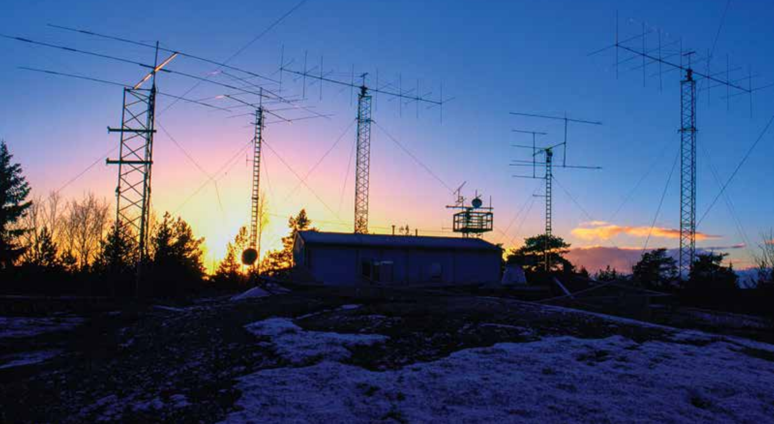
Antennas belonging to a ham radio club near Stockholm, Sweden stand in the glow of a sunset.