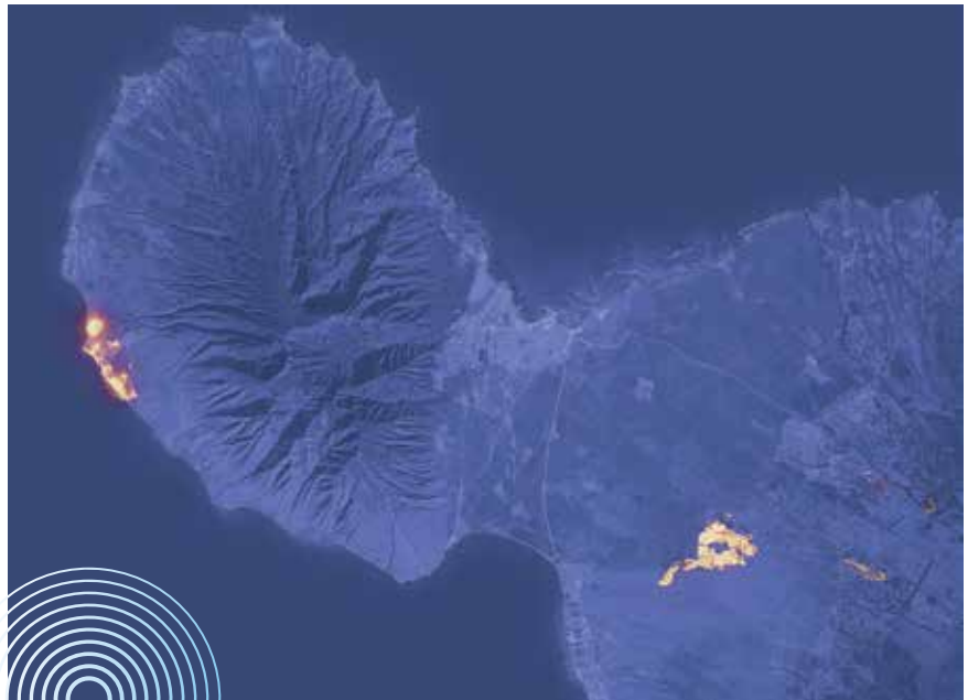
The image above shows the signature of the fire at 10:25 p.m. local time on August 8, 2023, as observed by the Operational Land Imager (OLI) on the Landsat 8 satellite. Much of Lahaina, a town with a resident population of nearly 13,000 people, appeared to be on fire at the time of the image. Another large fire burned northeast of Kihei.

FEMA had announced the new agreement on Twitter, stating, "We recently signed a new MOA with @arrl — establishing our partnership with licensed, voluntary amateur radio operators to support response [and] recovery efforts. We are honored to work side by side to meet the needs of millions in the wake of disasters."