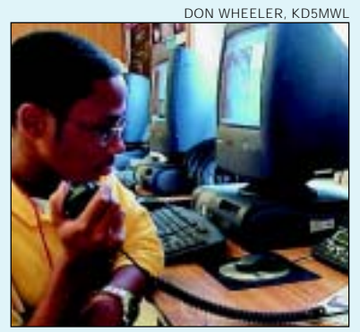
SKYWARN is an important part of Amateur Radio at Richwood High School. This year students participated in SET exercises.