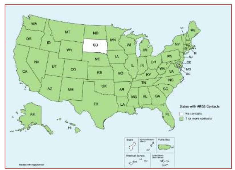
US ARISS Contacts—only missing S.D.—from Dec 21, 2000 to December 31, 2022