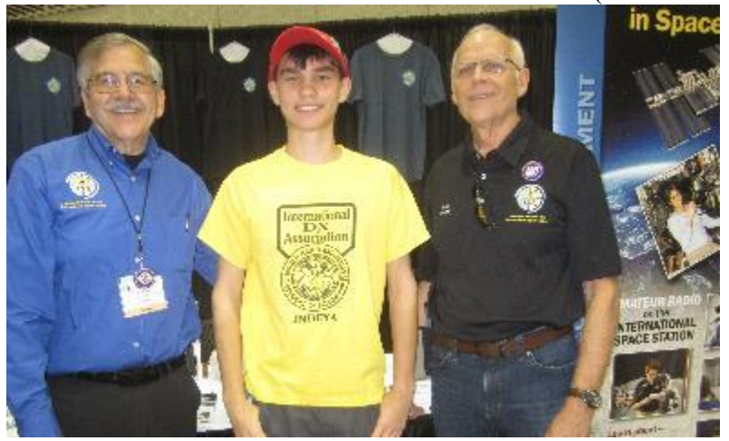
Photo below: ARISS booth at Huntsville Hamfest (ARISS also presented a forum)