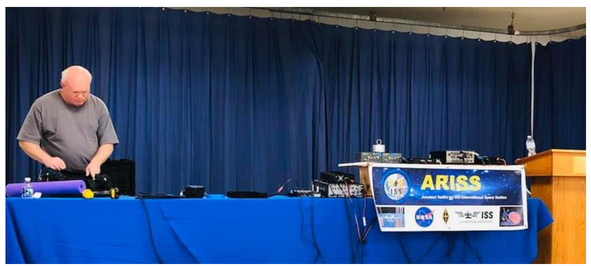
Typical auditorium set-up for ARISS radio contact has ARRL diamond displayed, ARRL video shown to huge crowds.