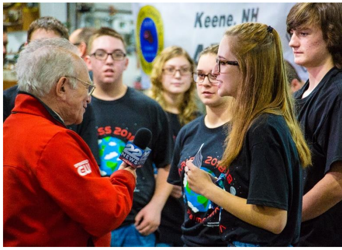
ARRL web pages