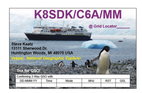
Figure 7 — The QSL card for Steve's Antarctic DXpedition.

The return trip across the Drake was also relatively calm, but we were sailing at fairly high speed, so the wind prevented extending the antennas. On the last night I was able to operate until rather late. When the time came to pack up, I didn't want to