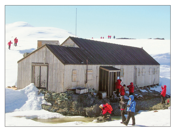
Figure 6 — The radio room at the Port Lockroy station.