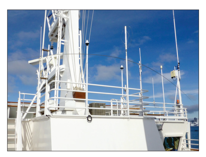
Figure 2 — The dipole set up for 20 meters, among the other antennas above the bridge.