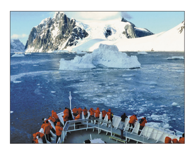
Figure 3 — Icebergs and mountains as seen from the Lemaire Channel.

and Spanish identifying it as Amateur Radio equipment, along with a copy of my license.