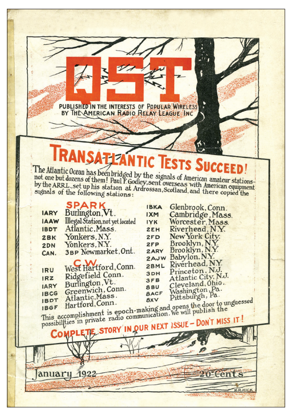
Figure 1 — The cover of the January 1922 issue of QST.

<sup>1</sup>Editor, "The Story of the Transatlantics," QST , February 1922.