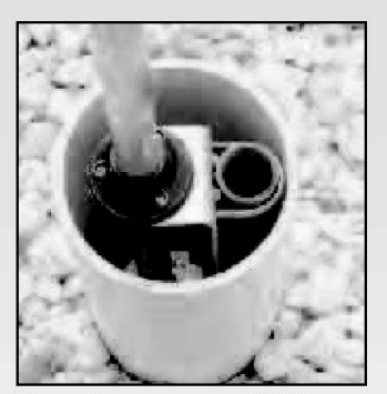
The author used 6 inch PVC pipe for the base.