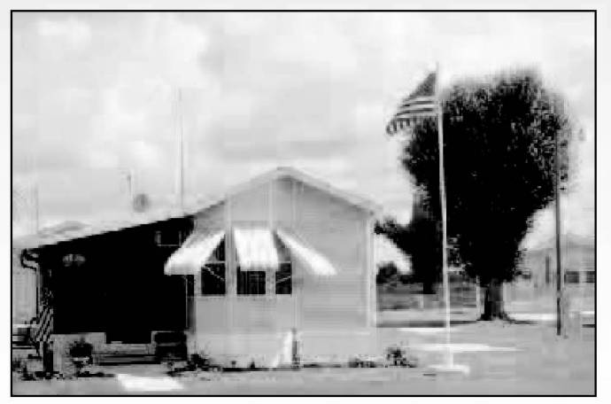
The completed flagpole antenna.