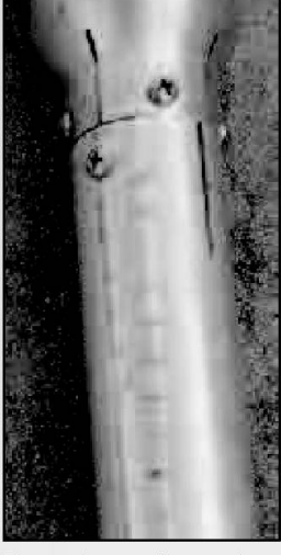
The author marked each trap carefully for optimum tuning.